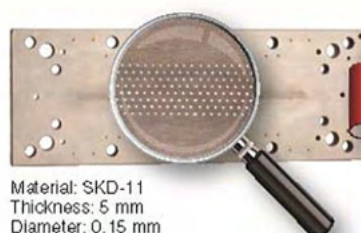
Material: SKD-11 Thickness: 5 mm Diameter: 0.15 mm