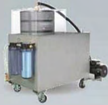
3. Filtration Water Tank