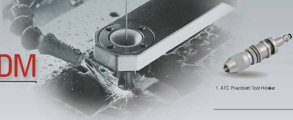
1. ATC Precision Tool Holder