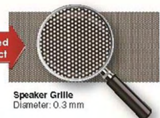
Speaker Grille Diameter: 0.3 mm