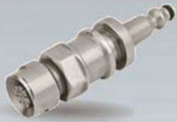
2. ATC Collet Holder